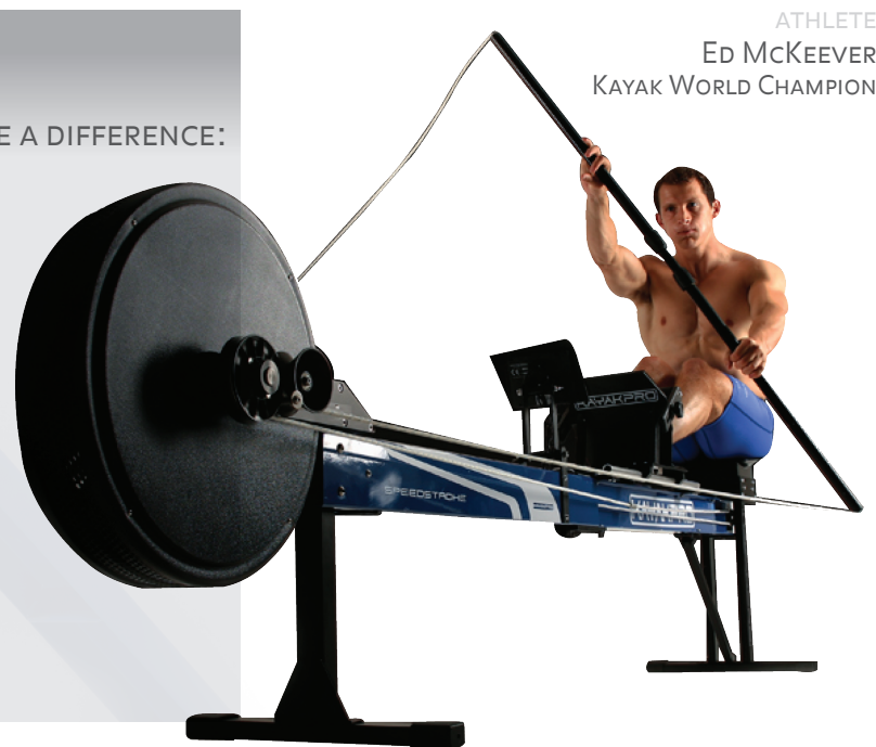
ATHLETE Ed McKEEVER KAYAK WORLD CHAMPION

FOR 200M RACERS WE ALSO HAVE AVAILABLE A "HI- RESISTANCE" VERSION OF SPEEDSTROKE GYM.